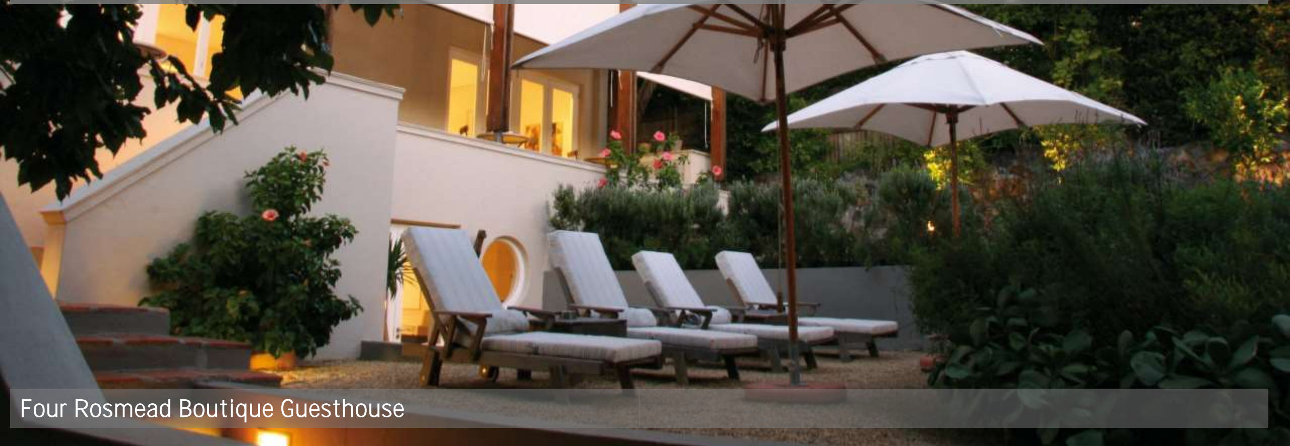
Four Rosmead Boutique Guesthouse

Spend the balance of the day at leisure.