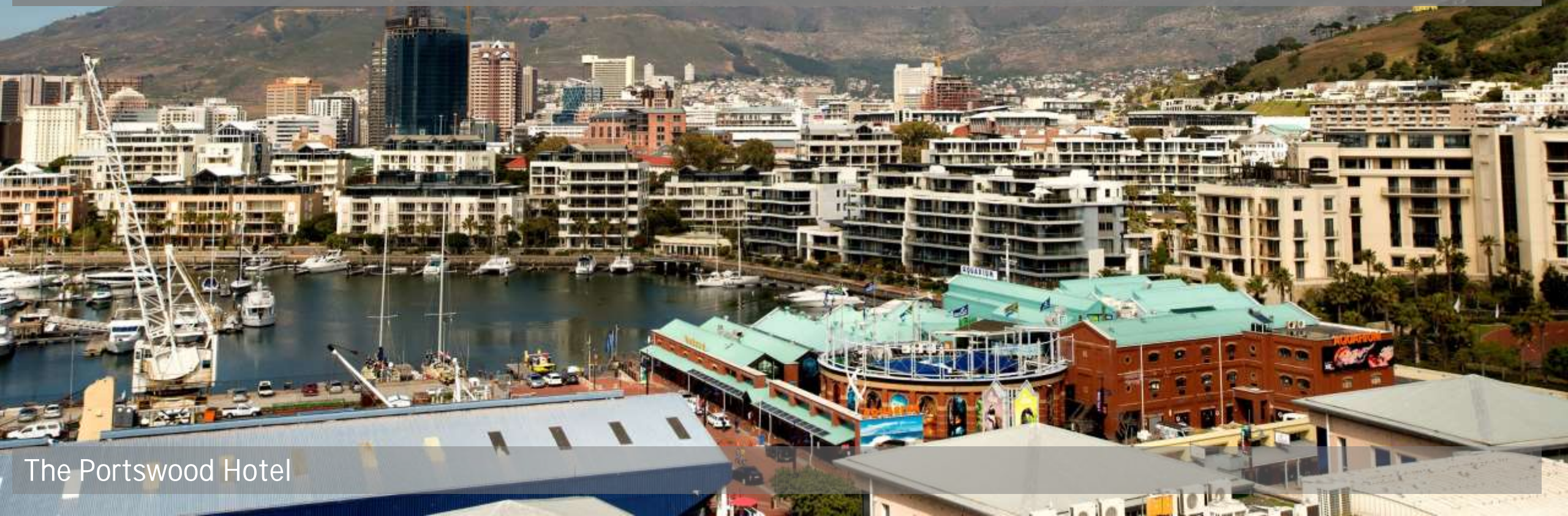
The Portwood Hotel

Spend the balance of the day at leisure.