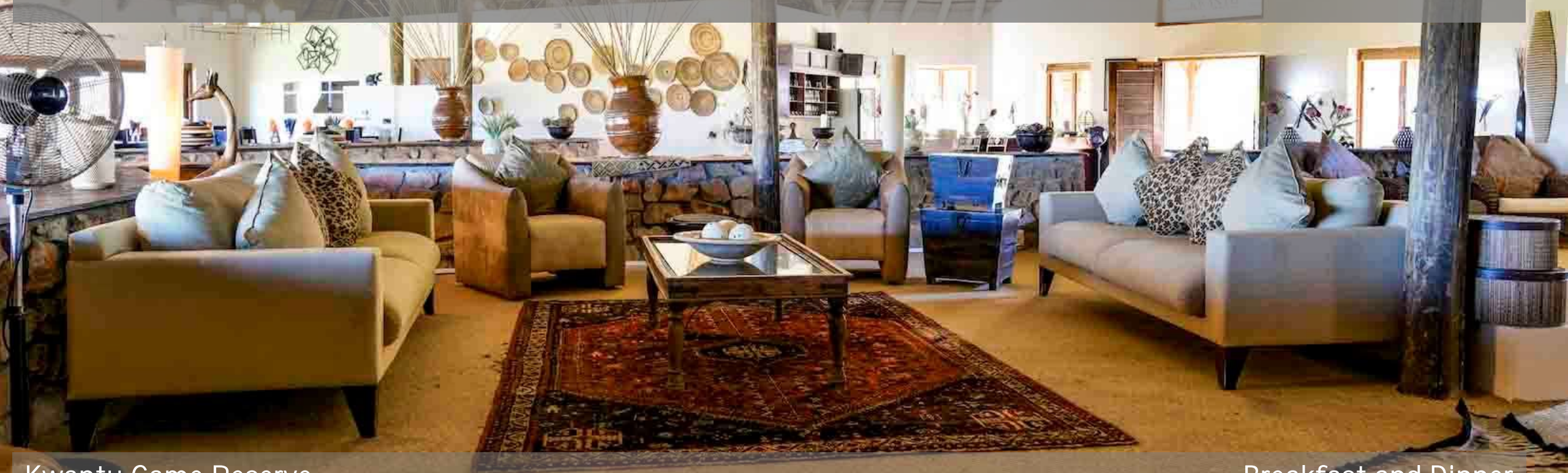
Kwantu Game Reserve

Proceed on an introductory open safari vehicle game drive. Dinner is served at the lodge.