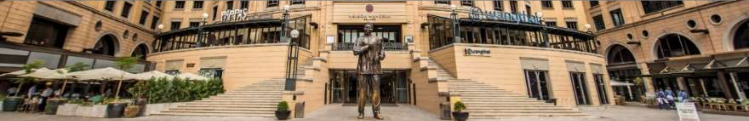
The Sandton Sun Hotel

FLIGHT DEPARTS FROM JOHANNESBURG TO FINAL DESTINATION